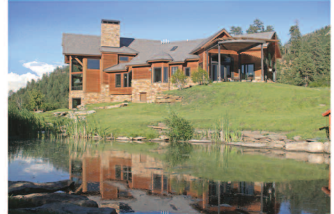
7,543 SQ. FT. MAIN RESIDENCE