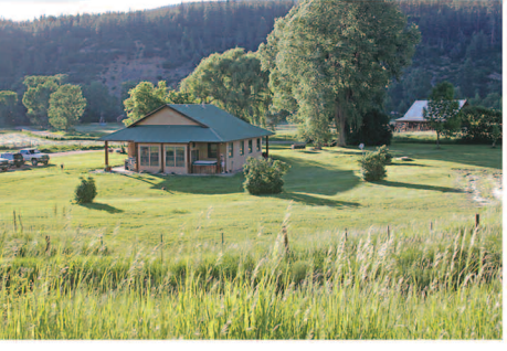
RANCH MANAGER'S HOME