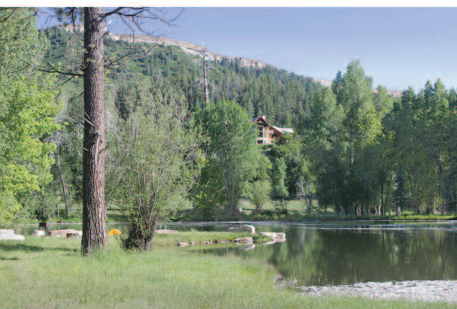
A SCENIC FISHING POND