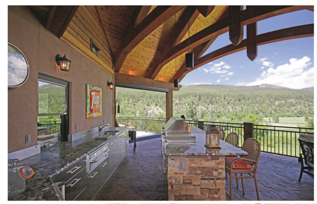
7778 CR 240, DURANGO — EL DORADO RANCH